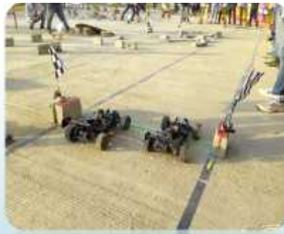
RC Car Racing