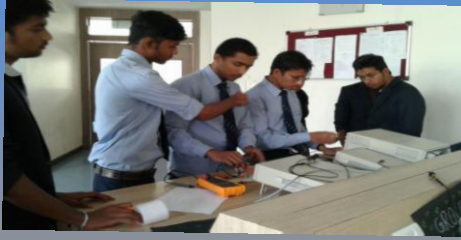
Watch Break Competition