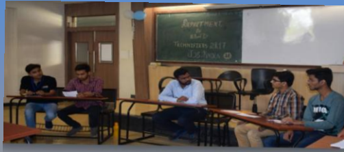
Group Discussion Competition