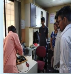
TE students visited Logic Power company in Vadgaon Budruk on 13/7/18.