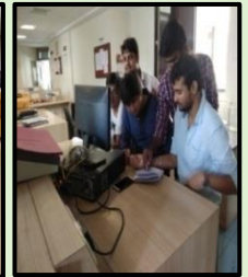
Workshop on PCB layout and designing on 23/8/18 and 24/8/18