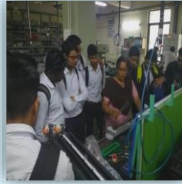
TE students Visited pune techrol on 29/8/18