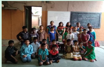
Visit to Nachiket Balashram, Akurdi, Pune was organized on Saturday 29/09/18 by all staff members of E & TC Dept