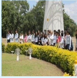
BE students visited GMRT on 14 th September