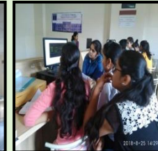
VHDL workshop was conducted for SE students on 27/8/18