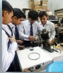
SE students visited toroidal on