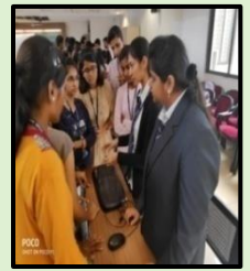
PC assembly workshop was conducted by TE students on 18/9/18