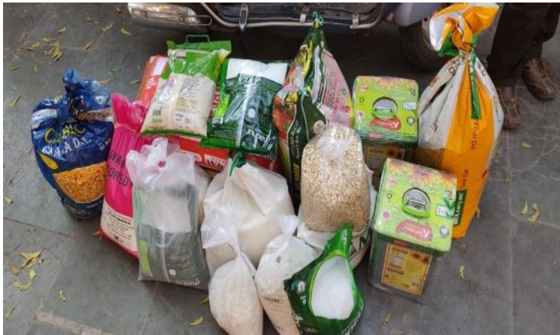
Photo 1: Food Grains for donation at NACHIKET BALGRAM on 23 rd Feb 2019

Pictures of the FOOD DRIVE are shared below so you can have a glimpse of this whole event.