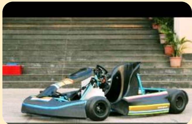
Go Kart Team along with their car their car