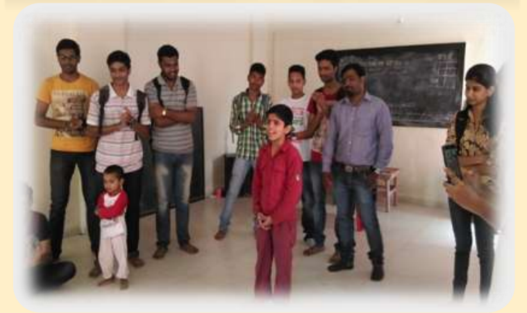
Visit to "Nachiket Balashram", Akurdi, Pune was organized by all staff members of Mechanical Department