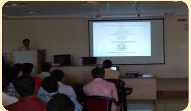
Seminar on “How to write a Research Paper and How to file a patent” was organized by Mechanical Engineering Department